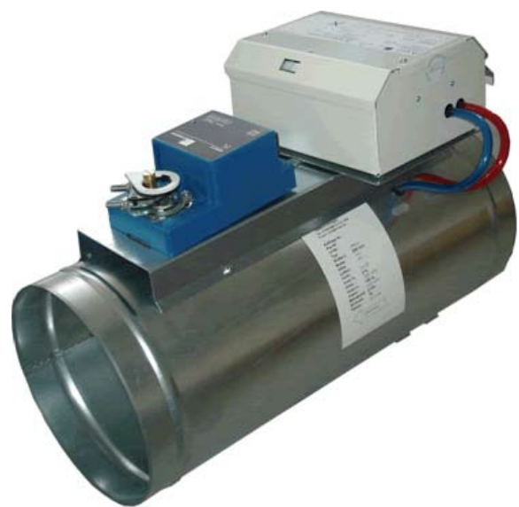
VRA-E air intake and extraction controller