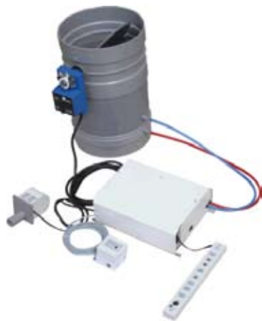
Components of FC-500 Lab Air Extraction Regulator