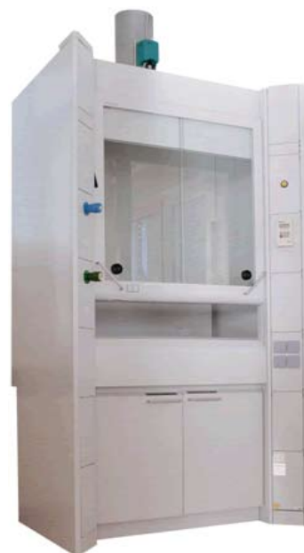
Lab air extraction unit